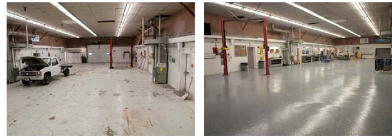
Before / After Waubonsee Community College (Sugar Grove, IL)